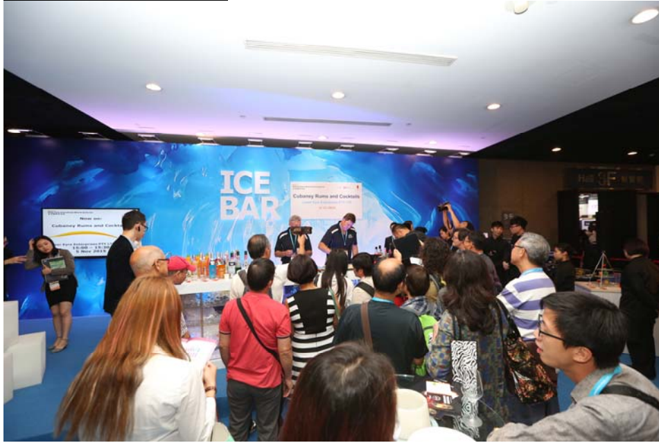
Ice Bar Layout at HKIWSF 2015 (For Reference Only. Layout and location subject to changes)