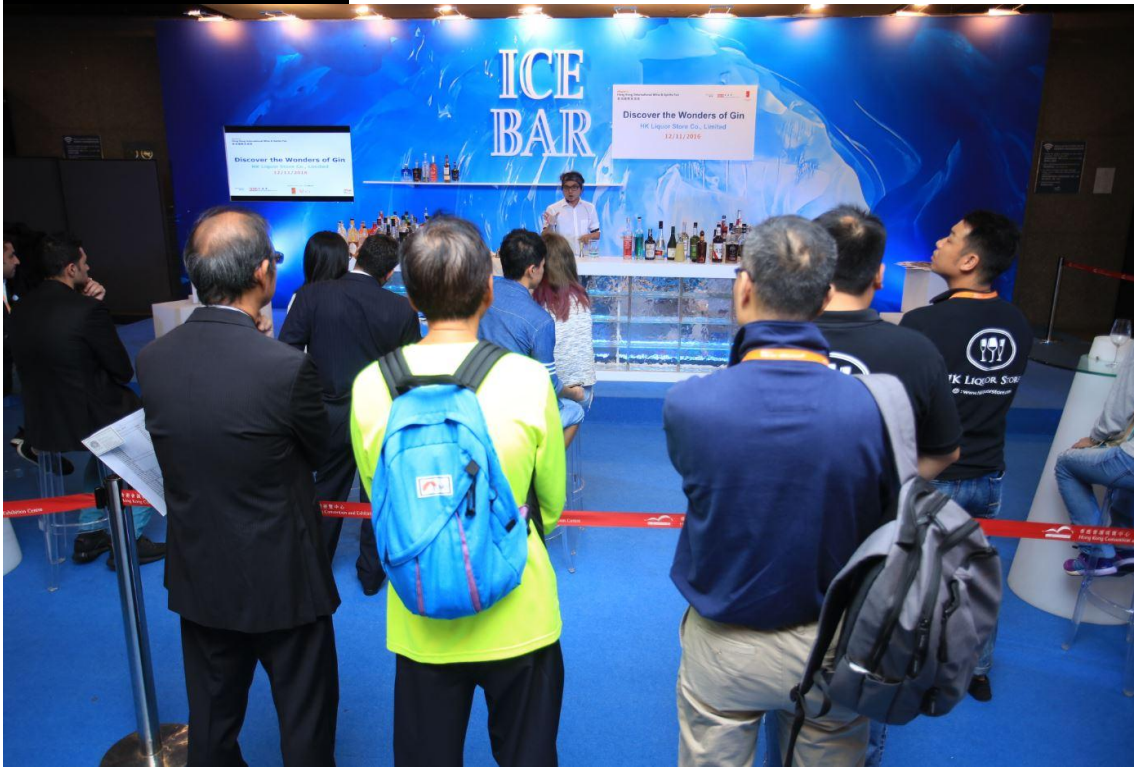
Ice Bar Layout at HKIWSF 2016 (For Reference Only. Layout and location subject to changes)