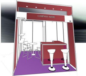
*Booth Appearance for Reference