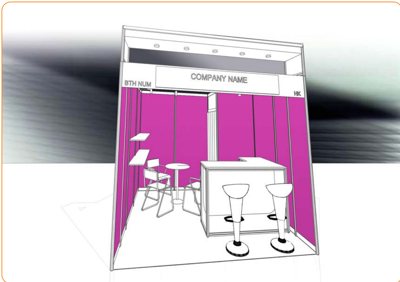
The color of company fascia and carpet will be remained the same as the original booth package. Company fascia color cannot be changed.